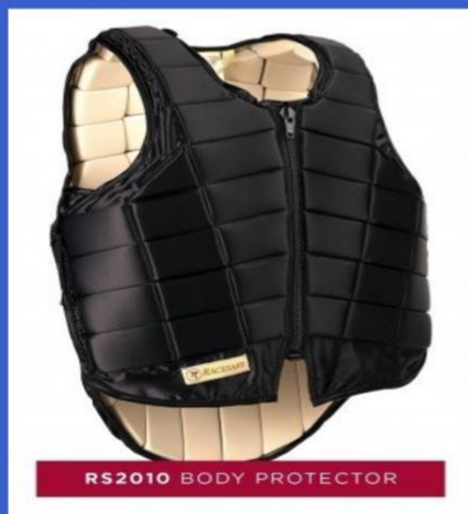
RS2010 BODY PROTECTOR

Treehouse Sporting Colours LTD New Farm, Rushock, Droitwich Worcestershire, WR9 0NR 01299 851625 info@treehouseonline.co.uk